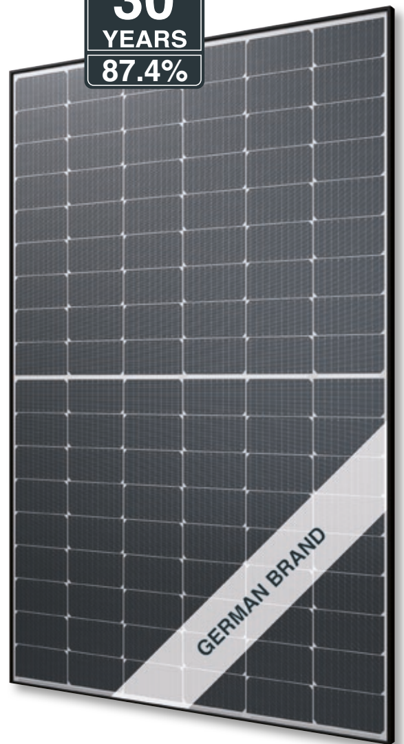
Fig. similar 108TFMLEN260331A